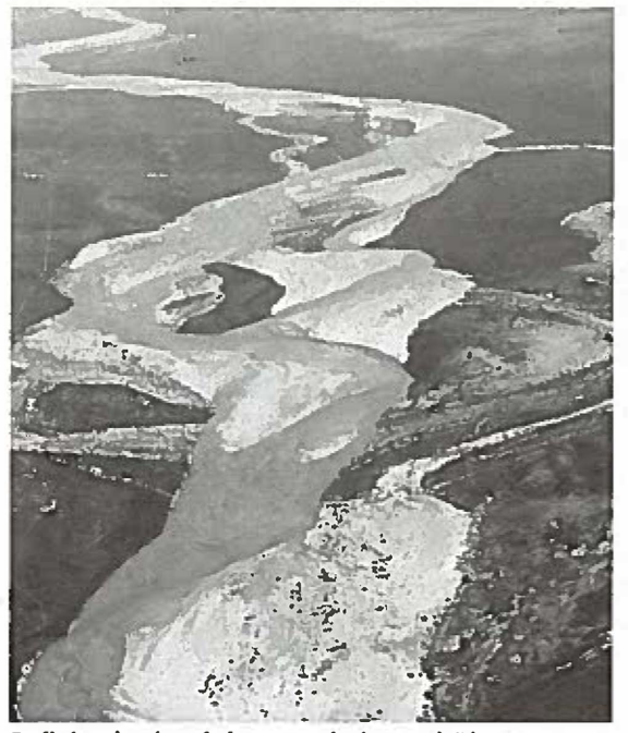
Defining banks of the meandering Red River presents problems to the boundary commission.

U.S. declared the boundary to be the south or main fork of the river. The Supreme Court ruled against Texas in 1896, stating the south or main fork was the boundary and that the south bank of the Red River was indeed the line