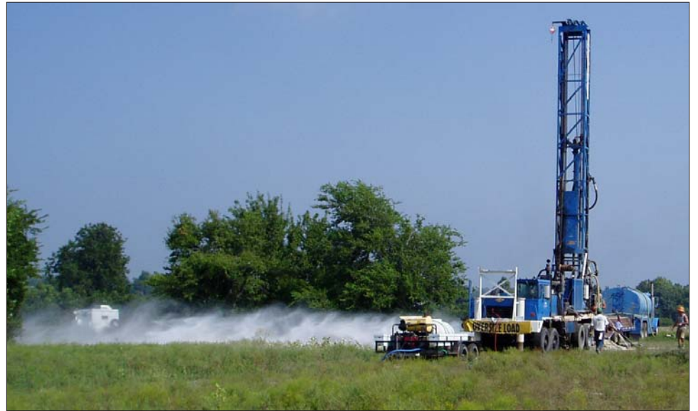
USGS drilling rig at test well. While drilling the deep test hole, air lifted up large volumes of water estimated at up to 1,200 gallons per minute.

ranging from 1,000 to 4,000 feet, is needed to understand the full extent of the fresh-water zone and the volume of water in storage in the aquifer. It is essential to determine the base of the aquifer, which is defined by the base of the fresh-water zone or basement (granite). Although information from petroleum wells is abundant on the flanks of the aquifer, it is sparse directly over the aquifer. Members of the Arbuckle Study Technical Peer Review Team believe