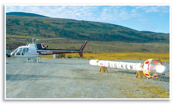
The helicopter and sensor prior to take-off

The study is being funded by USGS in cooperation with other state and federal agencies, such as the Oklahoma Corporation Commission, which is contributing additional funds to map possible underground salt-water contamination in nearby oil fields.