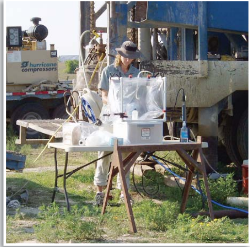
Carol Becker, a hydrologist with the USGS, collecting water samples from the test well

of deep groundwater can determine recharge rates of the lower regions of the aquifer, and it can better define the direction and velocity of groundwater flow. USGS scientists are analyzing water-quality data collected for the deep test well in addition to other data col-