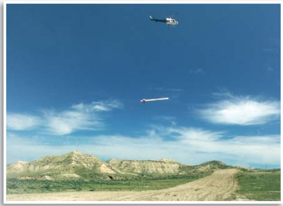
Helicopter and sensor during a previous study

and reflect off rocks to create a picture underneath the ground. Similar to a medical CAT scan, data obtained from the helicopter electromagnetic and magnetic (HEM) survey can be used to produce subsurface images of the electrical structure of the earth. According to Dr. Bruce Smith, a geophysicist with the U.S. Geological Survey, researchers can see much more detail of the earth's subsurface than ever before by using this technology.