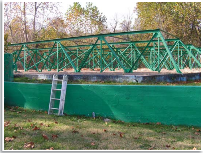
Cement enclosure and metal truss covering Byrds Mill Spring

If you visit Byrds Mill Spring today, you will not see a scenic bubbling oasis; rather, you will see water flowing from under a large cement structure topped with a metal truss. After purchasing the spring in 1910, Ada built a simple concrete wall