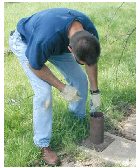
An OWRB hydrologist measures the initial depth of a well selected for installation of a water level recorder. The well, located south of Connerville in the eastern region of the study area, is one of 10 wells equipped with the automated groundwater level recording device.